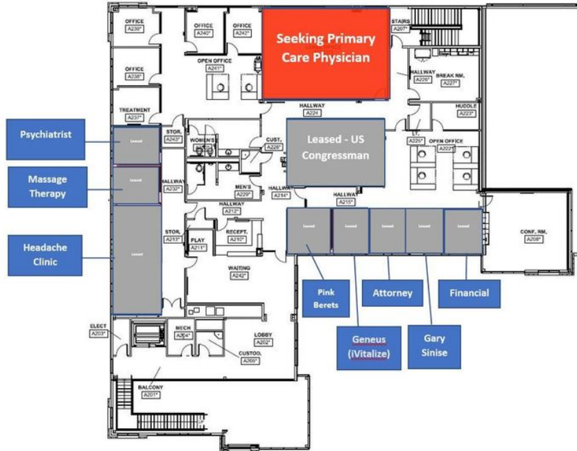
1 SECOND LEVEL FLOOR PLAN